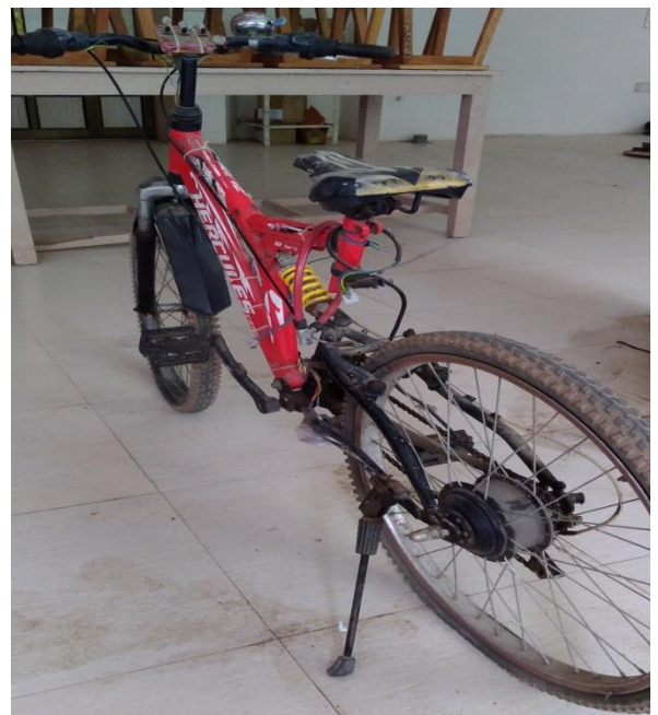
Pedal Assist Electric bicycle