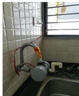
Instant Water Heating Tap