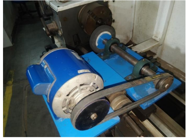
Cylindrical Grinding Attachment for Lathe