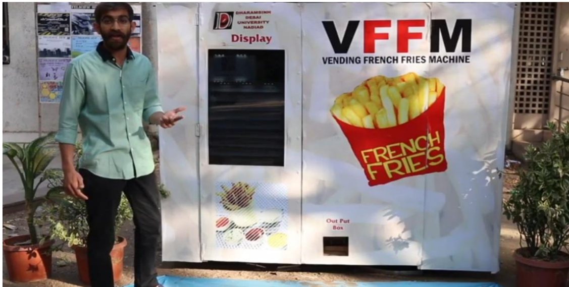
Vending French Fries Machine