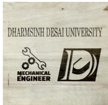
2D Laser CNC Engraving Machine with Engraving work on Wood