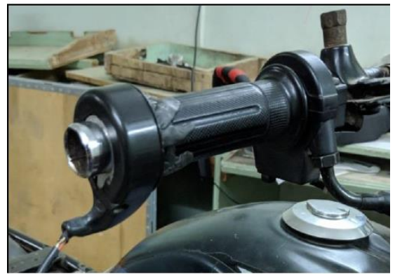
Hybrid Electric Motorcycle (IC Engine + Hub mounted Motor at front wheel)