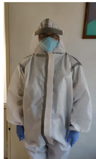
Seam Sealing Machine for Medical PPE Suit