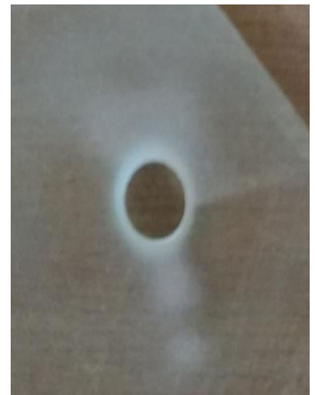
Abrasive Jet Machine with demonstration of machining on MS plate and Glass