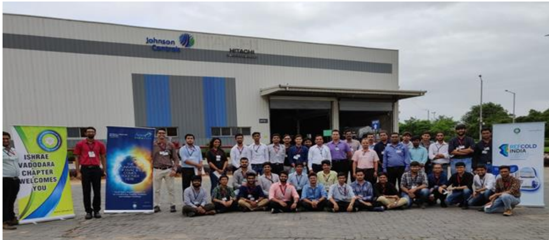
A group photo of DDU students at Hitachi Air-conditioning India Ltd