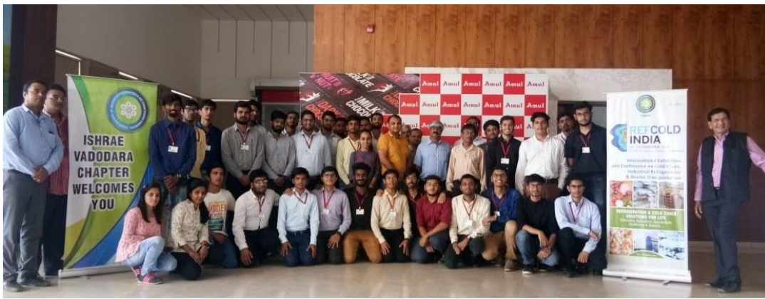
A group photo of DDU Students at Amul Chocolate plant