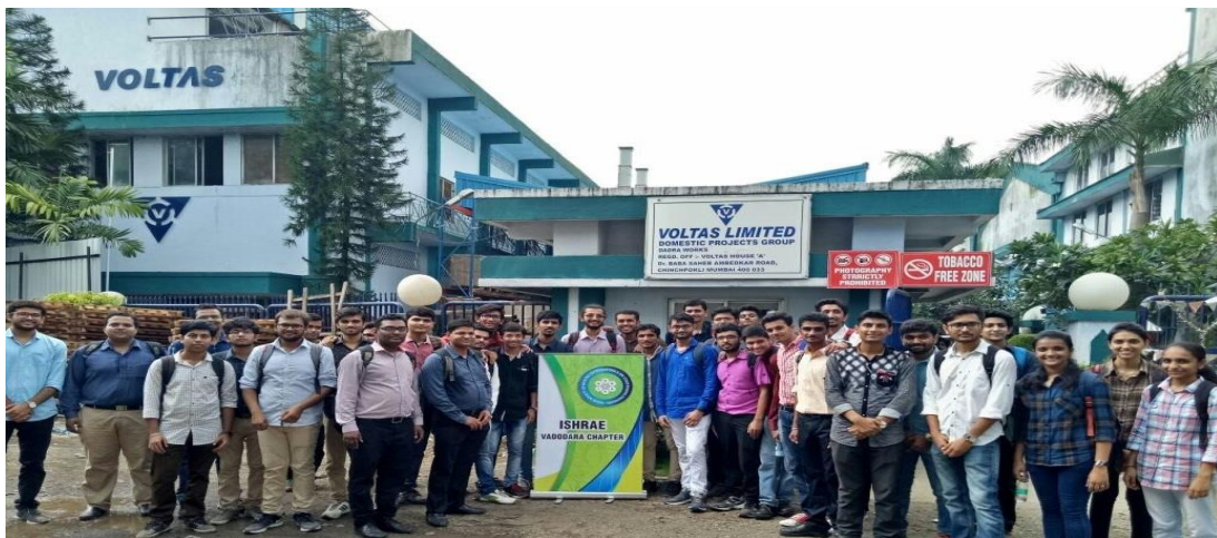
A Group photo of DDU students at Voltas Ltd